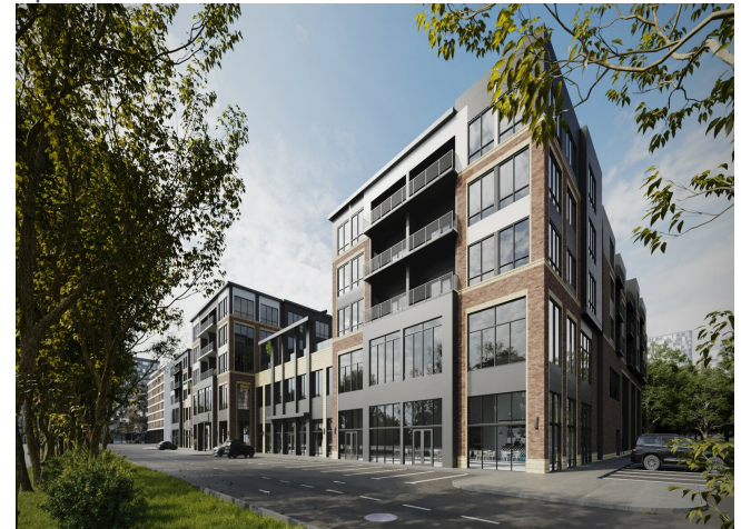
RETAIL - FIRST FLOOR